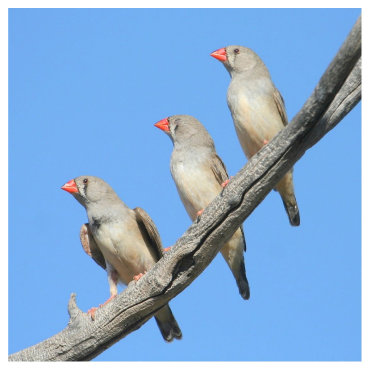
Three female Zebra Finches