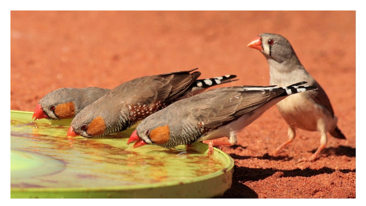
Zebra Finches drinking water by sucking, in pigeon style

The genus name also references our bird's barred tail – it derives from the Greek words tainia , a band, and pugē , rump or tail. The species name is from the Greek words kastanon , chestnut, and notos , backed.