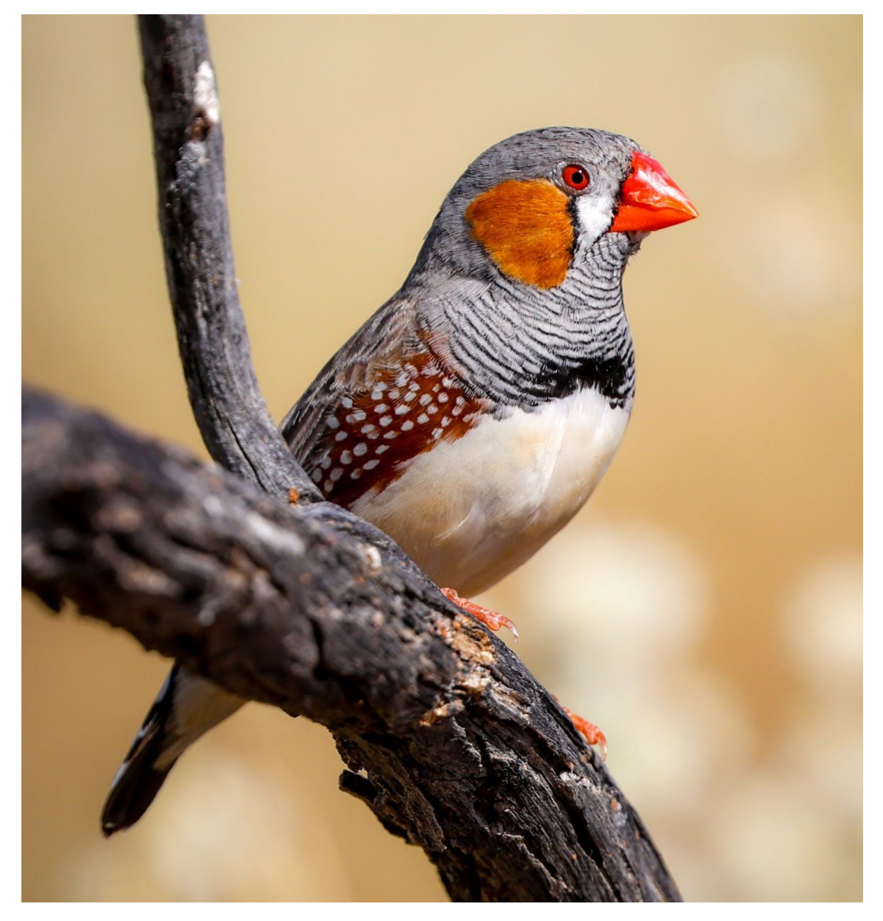
A male Zebra Finch