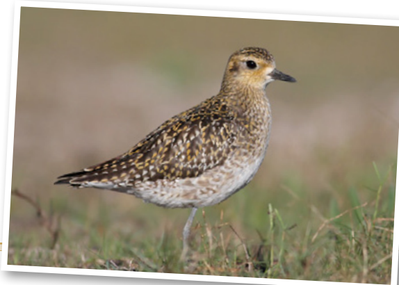
Pacific Golden Plover

wetlands along a dilapidated boardwalk that starts from Franklin St, near its intersection with Mustons Rd. There are no facilities.