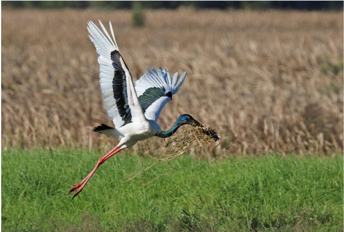
Black-necked Stork